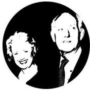
Dorian & Antony Fisher Venture Grants

The Atlas Economic Research Foundation announced the recipients of its inaugural class of Dorian & Antony Fisher Venture Grants. These nine young think tanks will receive up to $100,000 from Atlas over the next three years: